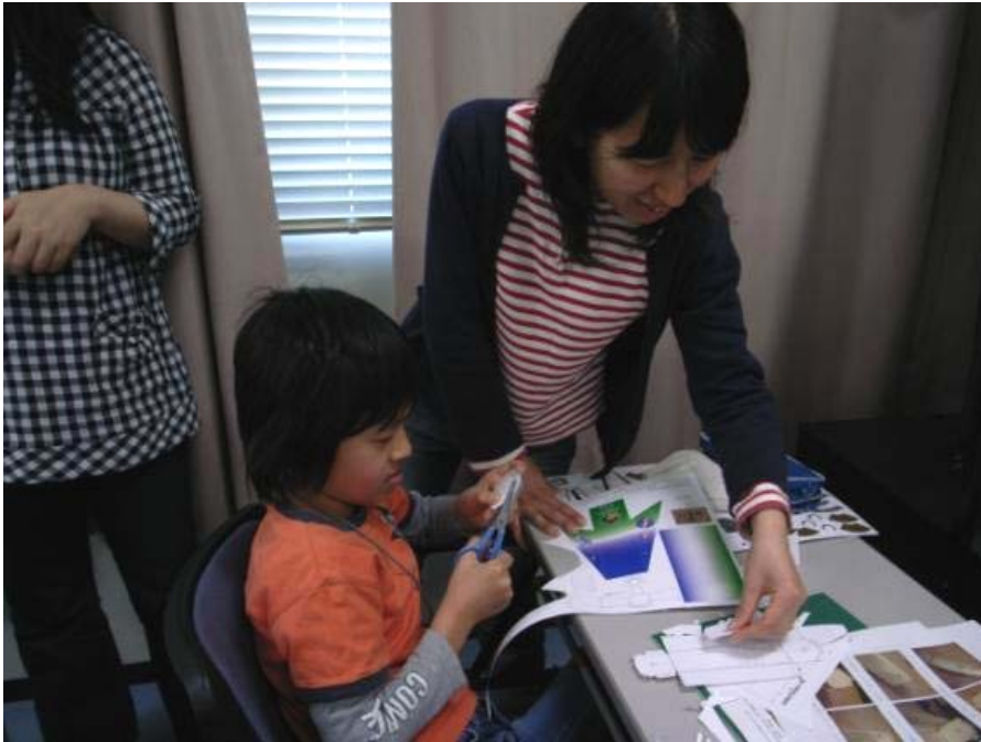
He is cutting out the cargo bay parts and his mother was helping arranging the parts to be glued.

YAC Hamamatsu Sector members actively fabricated the STS-131 Space Shuttle as shown below. Total number of the sector members attended were 23, aging from 7 to 13 years old. They were assisted by their parents.