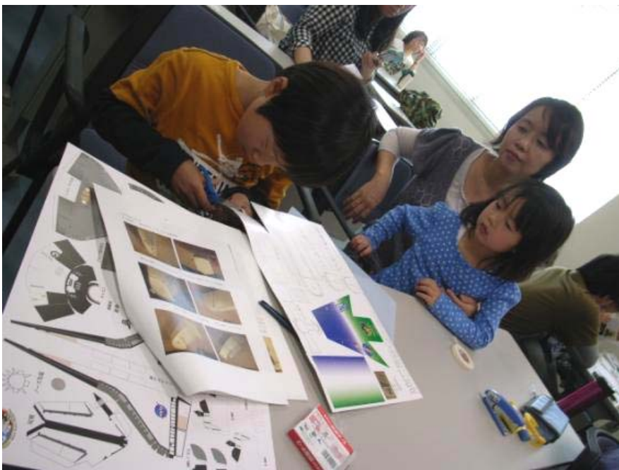
He is also cutting out the cargo bay parts and his mother and sister was watching him to use his scissor. We have translated the manual into Japanese for them to refer.